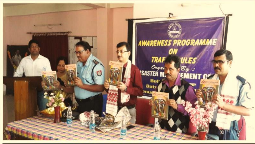
Awareness Programme on Traffic Rules for Students held at College