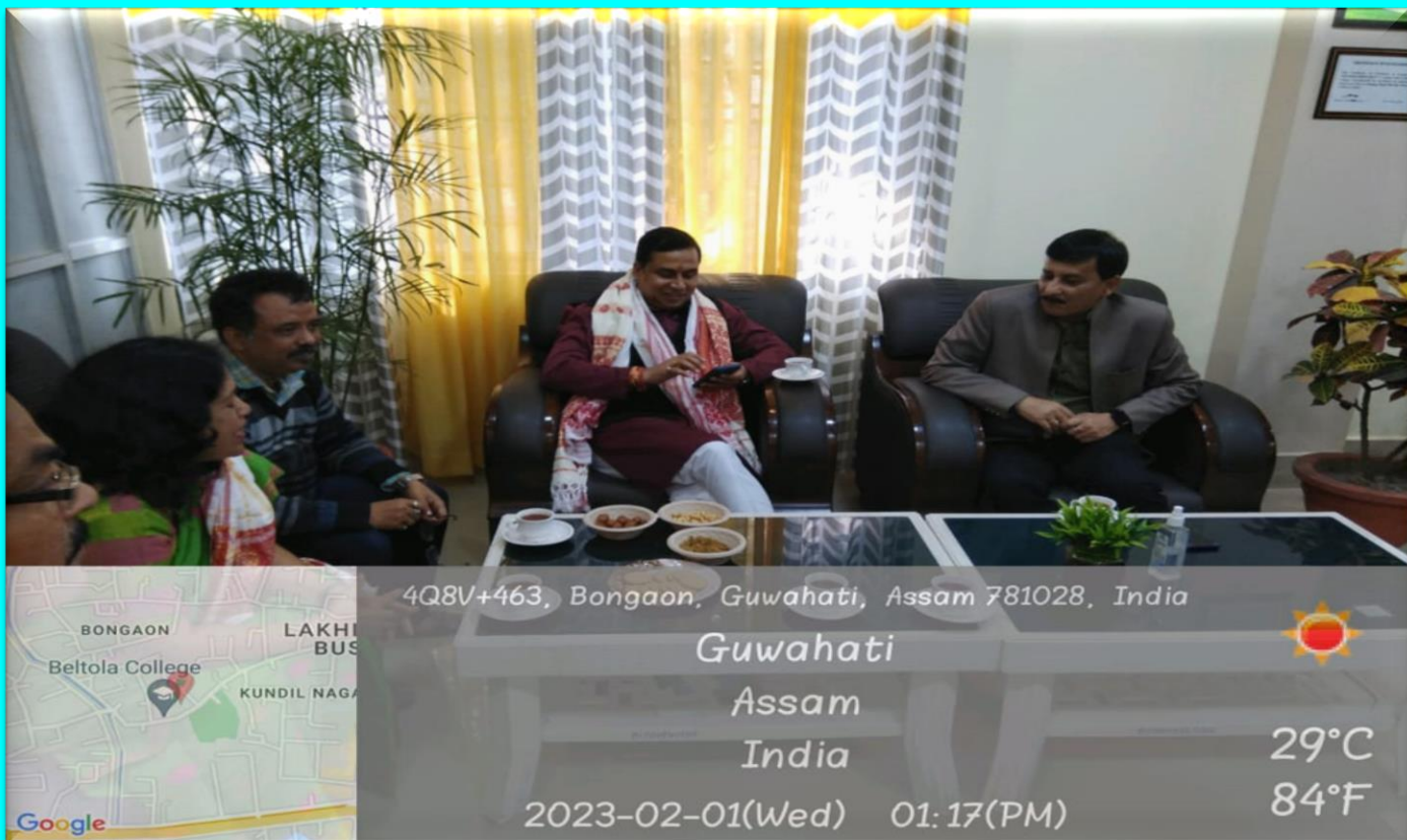
Hon'ble Minister Public Health Engineering, Skill, Employment & Entrepreneurship, Tourism JAYANTA MALLA BARUAH visits Beltola College