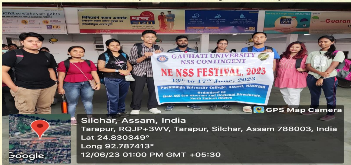
National Programme of NSS team from Assam