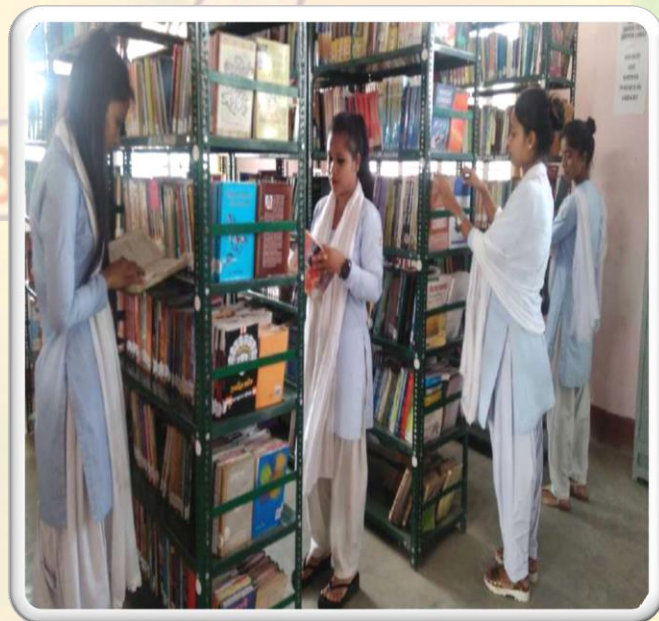
Users' Searching books in the College Library

❑ GAMES and SPORTS, literary and cultural ACTIVITIES: Various Competitions are organized from time to time to bring out the hidden talent of the students of the college. These are organized by Beltola College Students' Union with the guidance of teaching staffs. Competitions to various extra – curricular streams are held during the annual college week festival. Good performers can represent the college in the Gauhati University Youth Festival and other inter college programmes. From the above mentioned competitions and activities, star performers are picked up for Youth Festivals and other inter College programme.