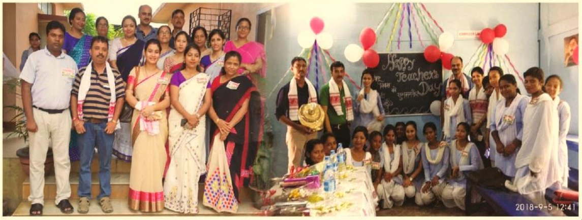
On the occasion of Teachers' Day Celebration