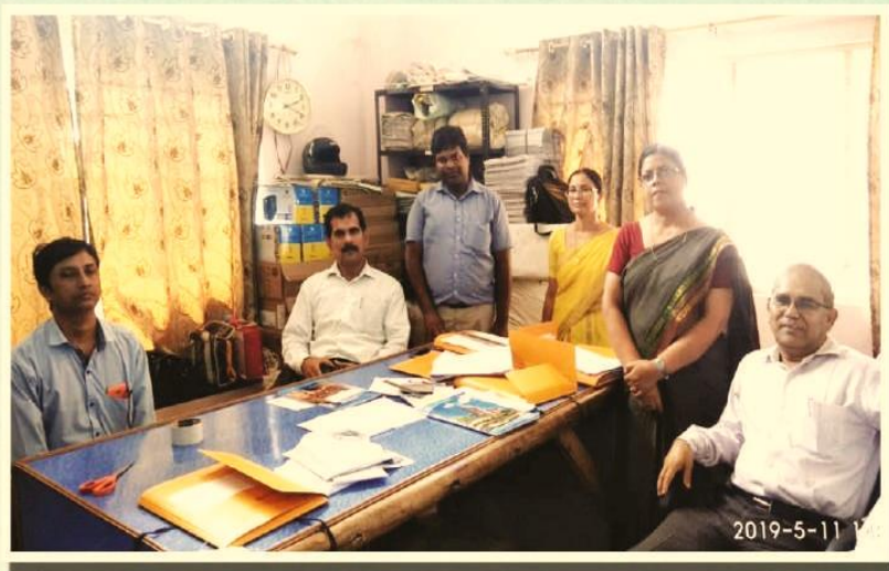
Deputy Controller of Examinations & his team from Gauhati University visited the College on 11 th May 2019