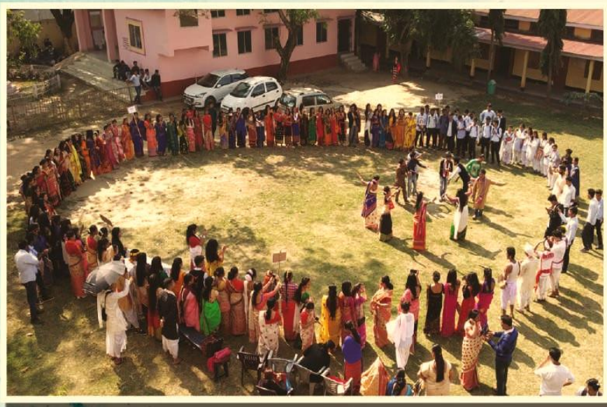
Cultural Programme held at the College Week Festival