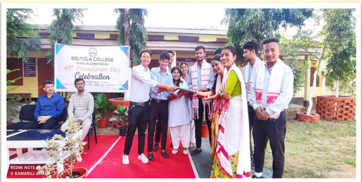
College Foundation Day Celebration