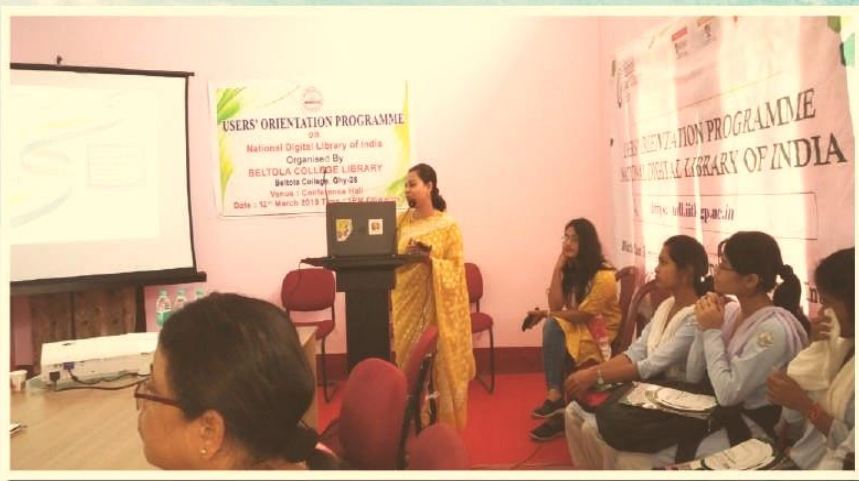
Orientation Programme on National Digital Library of India organized by the College Library