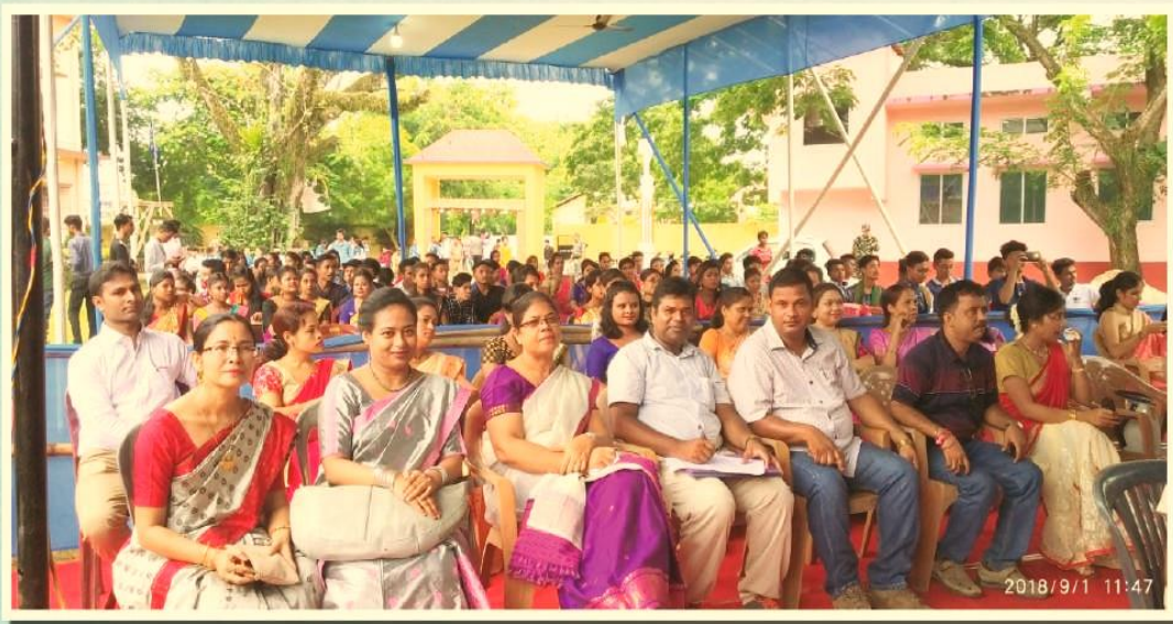
Faculty Members & Students are presence in the eve of College Freshman Social