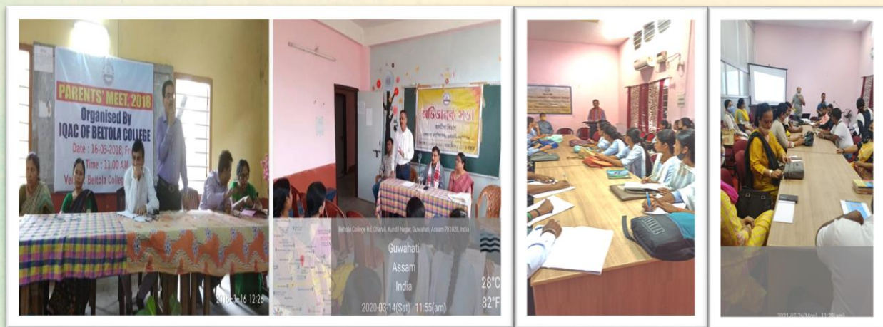
Meet held at College