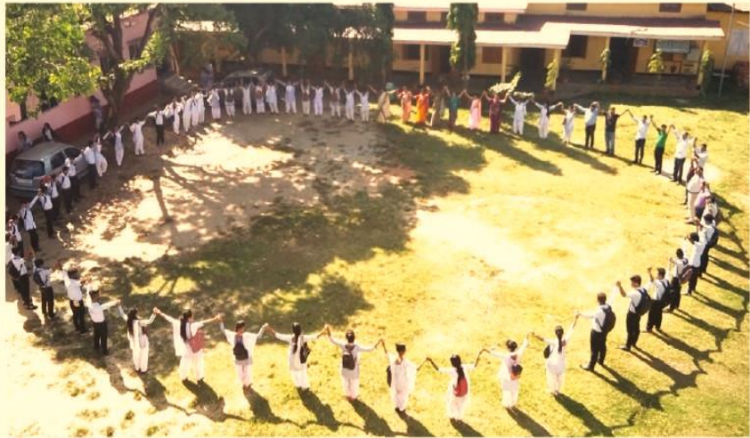
Human Chain (a Symbol of Unity) by the College Students & Faculty Members