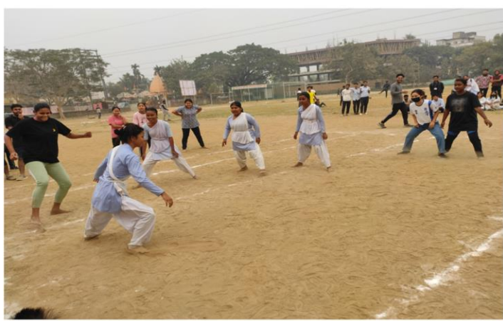
College Girls & Boys are participating in the College Week

❑ Library : The College has a well-organised library with a good collection of text books, reference books and other valuable books related to different subjects. A wide number of Journals, Magazines/Periodicals and Newspapers are also maintained in the library. Students are issued one library card each which should be renewed yearly. Library orientation programme is organised for the newly admitted students. The library has Library Management Software SOUL 2.0 for the automation of the house keeping operations of the library. The library provides access to e-resources through NLIST (National Library and Information Services Infrastructure of Scholarly Content) programme. The library offers spacious reading hall along with internet and reprography facility.