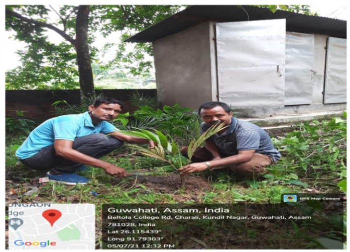
Various Programme organized by NSS Unit of the College