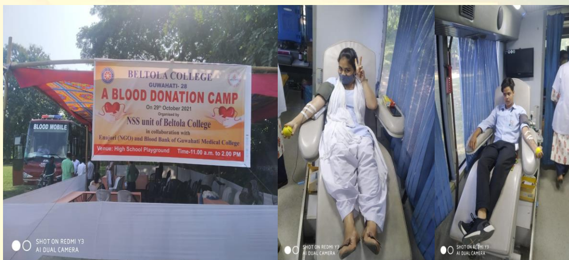
A Blood Donation Camp Organised by NSS Beltola College