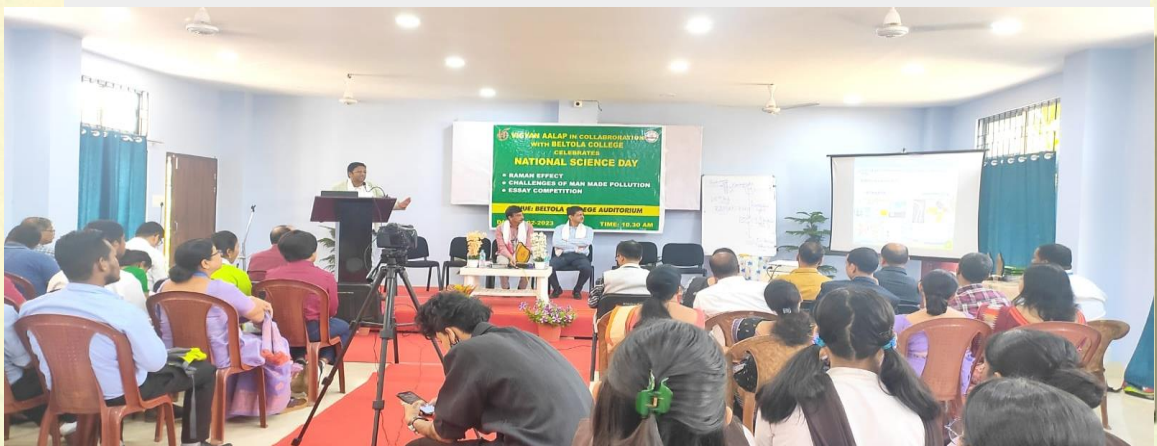
Vigyan Aalaap a well-known NGO in collaboration with Beltola College