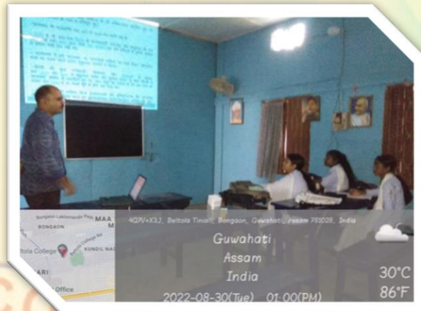
Faculty Member of the College taking a Smart Class

❑ MUSEUM: A collection of various artefacts has been put in a small museum in order to provide exposure to the students and visitors to the colourful cultural heritage and tradition of North Eastern Region.