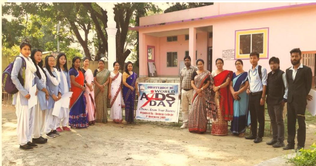
Observation of World AIDS Day at College