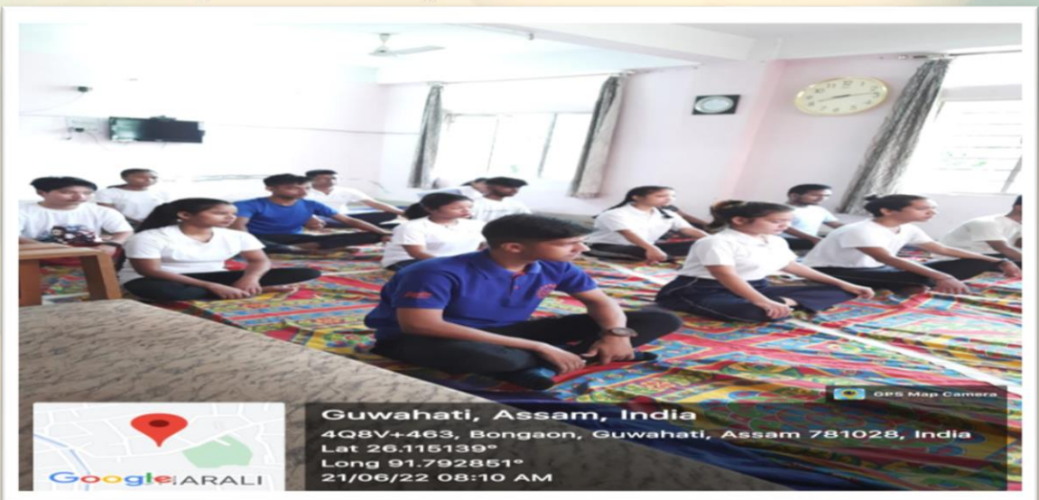
Observation of Yoga Day at College