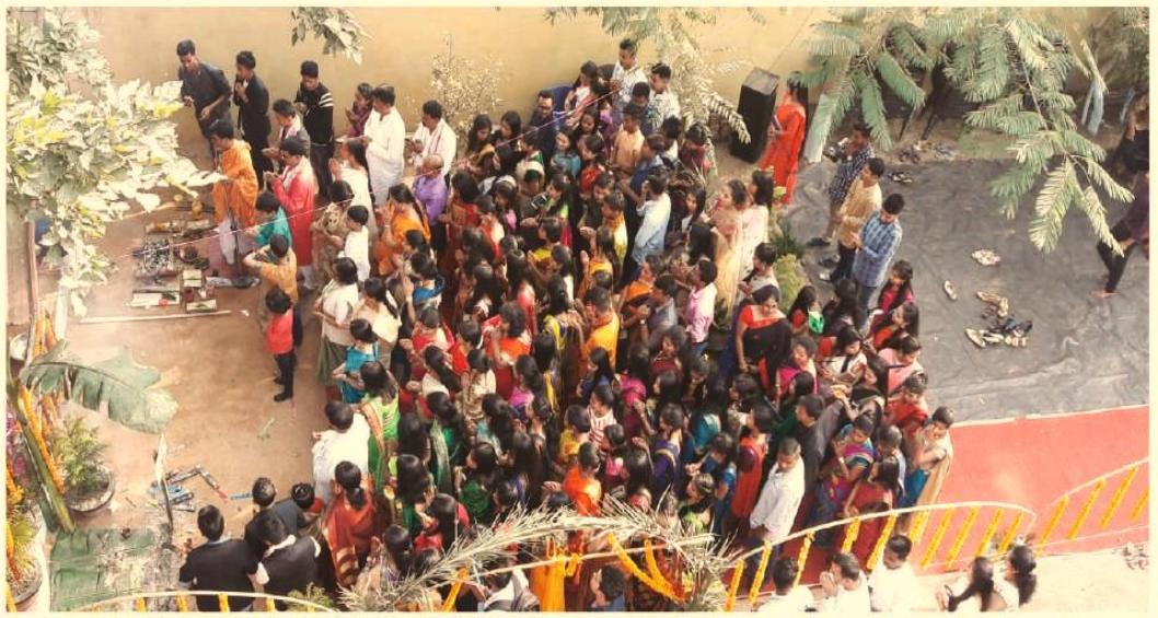
Students are present on the occasion of 'Nirmali' on Saraswati Puja