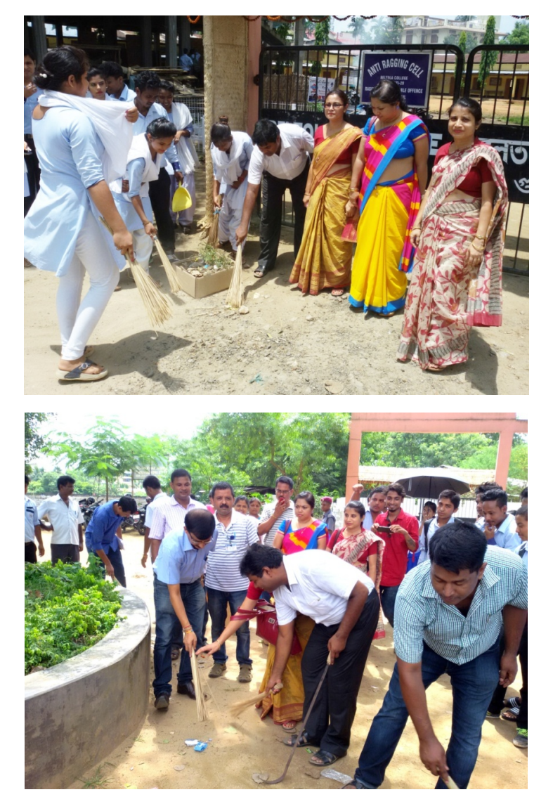
A REPORT ON "BELTOLA COLLEGE NSS UNIT" FORMATION.